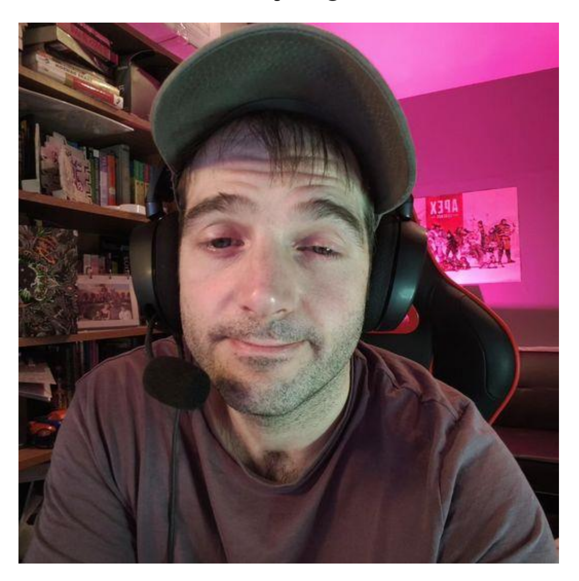
Thanks again for all your support!

There's so much more I could tell you about the work, but I'll leave you with this endearing photo after 24 hours of livestreamed gaming! I completed this challenge as a way of raising my support levels for Youth for Christ. I must be getting old as this was way harder than I expected! I crashed about halfway through, possibly because I hadn't eaten enough!! But thankfully lots of people encouraged me along and I got to the finish line. Phew - it's all worth it for the kingdom.