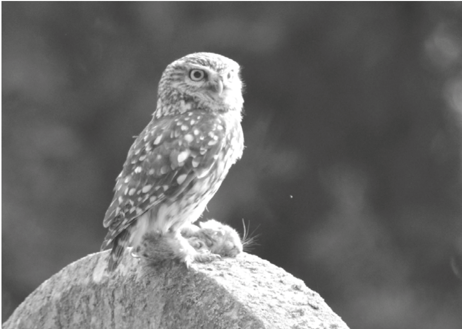
This lovely picture is a Little Owl sitting on a gravestone in Stoke Holy Cross churchyard with its prey.

I live in Stoke Holy Cross, I am passionate about wildlife and nature and have been asked if I would share something with you the readers of the Free for All. We are so lucky to live in South Norfolk as it's a wildlife haven for plants, fungi, invertebrates, mammals and birds.