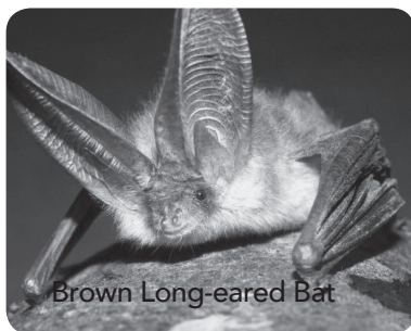
Brown Long-eared Bat