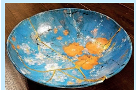
SEE ROB'S ARTICLE INSIDE